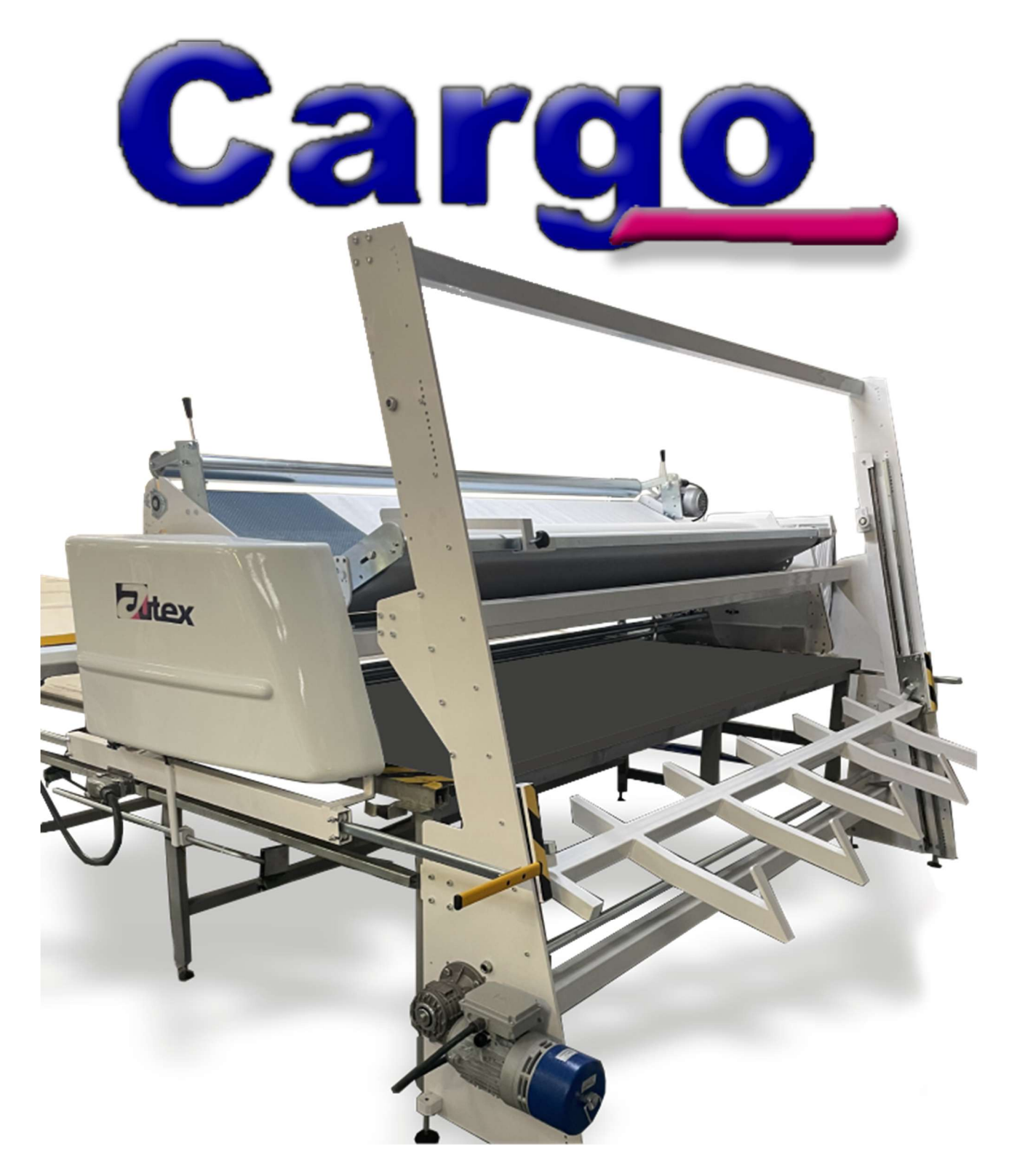
WIDE RANGE OF FAST AND SAFE LOADING LOADERS THAT FACILITATE LOADING FROM THE TABLE